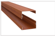
2" x 4" Self-Mating Batten

Created as an alternative to our two-part batten system, Parallel Triple-Lock Battens are a sleek, self-mating option for achieving your desired design goals. Whether it's a quick privacy screen, an indoor feature wall, or an addition to your building's façade, these adaptable battens provide a solution that's modern, low-maintenance, and durable — as always.