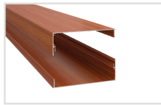
2" x 6" Self-Mating Batten